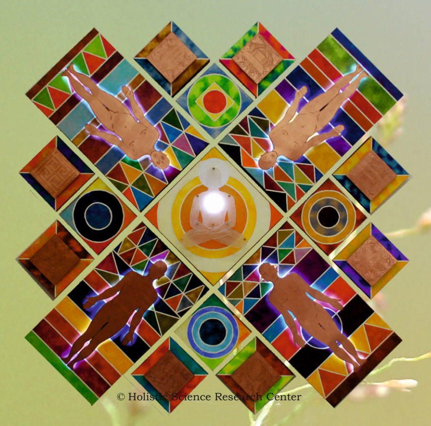
Electrified 3D Mural in HSRC Surat

This will surely herald the heaven of happiness on this earth. The evolution of mankind will result in the emergence of "Man" with multifarious human values, contribution to the creation of a unique, Utopian world and Oneness of mankind will be elevated to the level of Divinity. Like Socrates, we too will say: "I am a citizen not of Athens, but of the whole world." There will be a chorus of "Vasudhaiva Kutumbkam" meaning the world is my family.