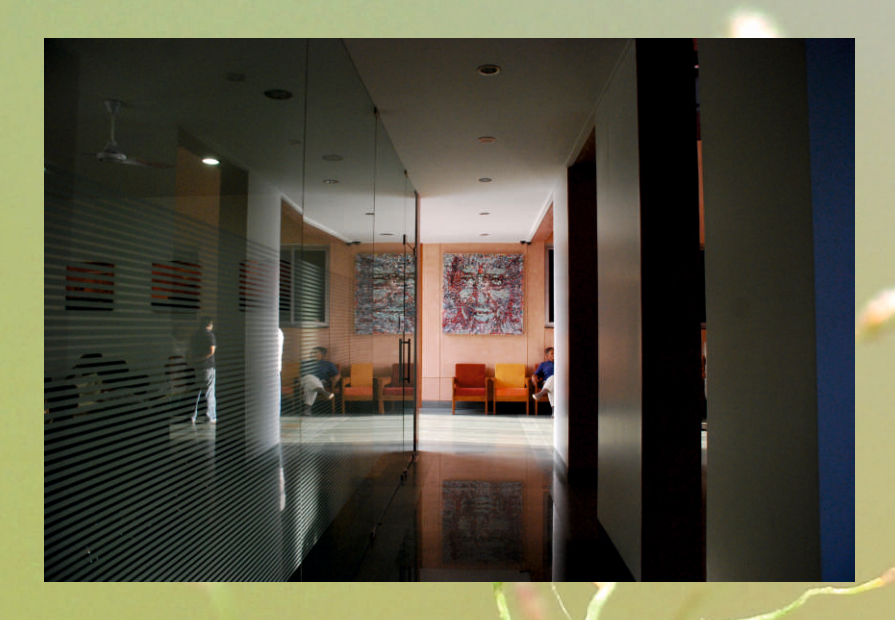
Partial view of atrium from the entrance of south gate in HSRC, Surat

* હેતલ પટેલ, બી.ઈ. ઈન્સ્ટ્મેન્ટેશન એન્ડ કન્ટ્રોલ, પીજીડીસીએ (અમદાવાદ)