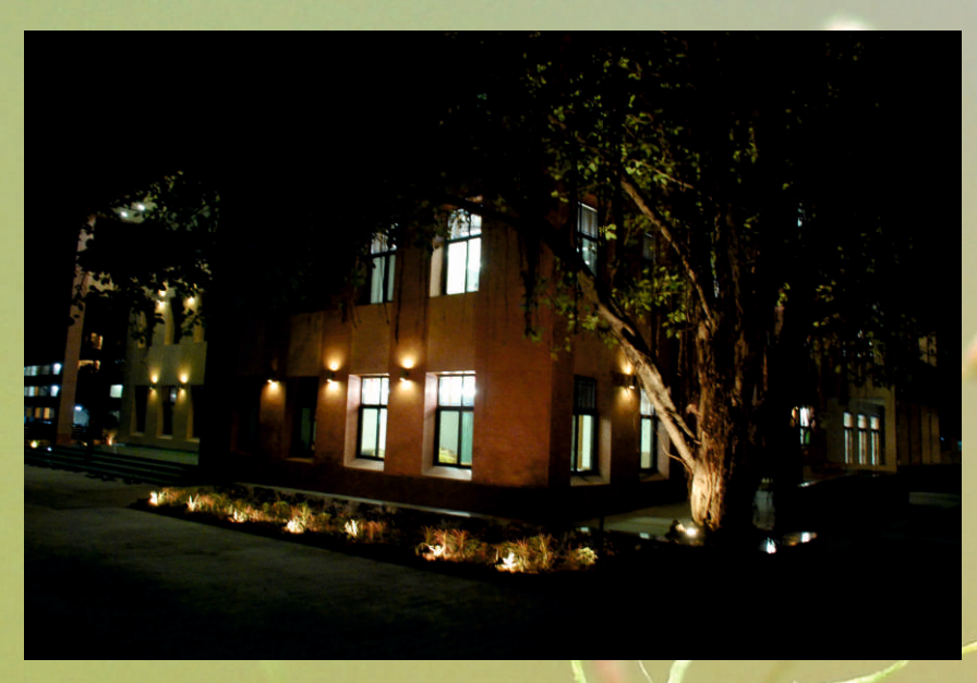
Vitrag Vignan Charitable Research Foundation (HSRC Surat) during night